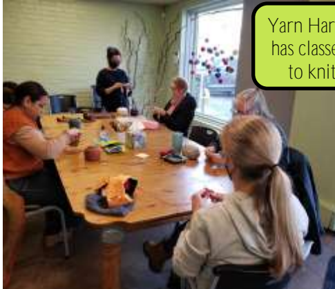
Yarn Harbor in Lakeside has classes to learn how to knit and crochet